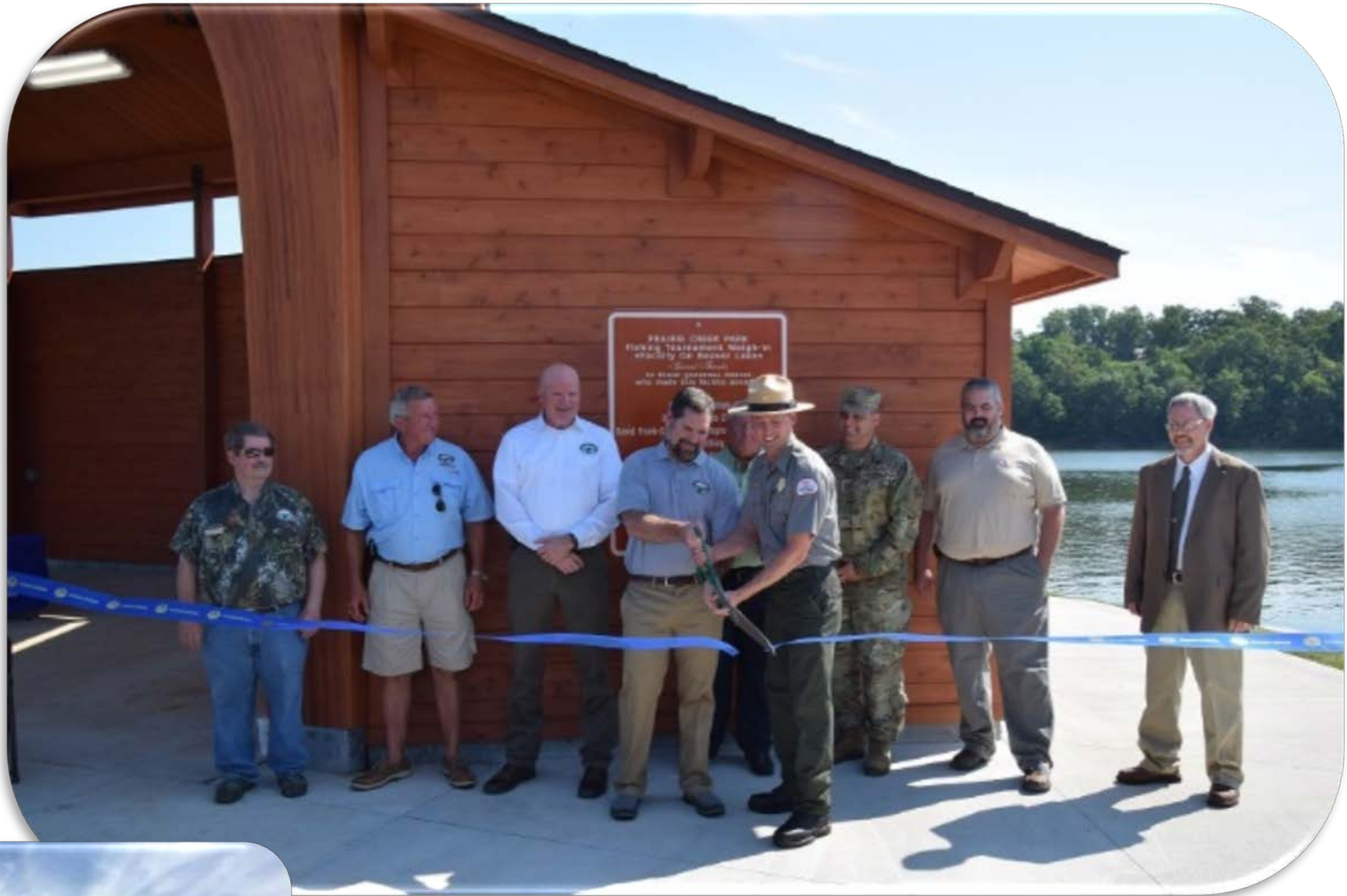
Little Rock District- Beaver Lake Prairie Creek Tournament Weigh-In Station